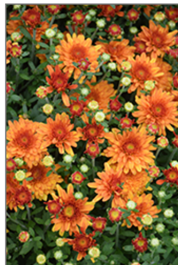
Arluno Orange Chrysanthemum flowers

Arluno Orange Chrysanthemum will grow to be about 24 inches tall at maturity, with a spread of 24 inches. It grows at a medium rate, and under ideal conditions can be expected to live for approximately 10 years. As an herbaceous perennial, this plant will usually die back to the crown each winter, and will regrow from the base each spring. Be careful not to disturb the crown in late winter when it may not be readily seen!