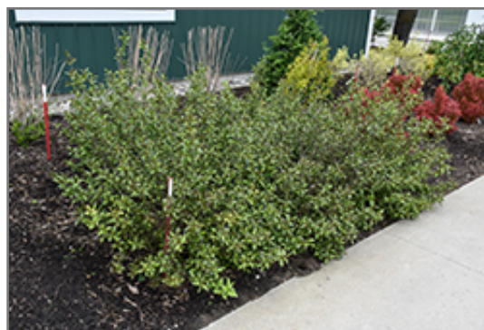
Vinho Verde Weigela