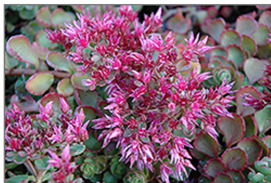
Fulda Glow Stonecrop flowers