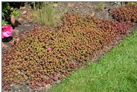
Fulda Glow Stonecrop