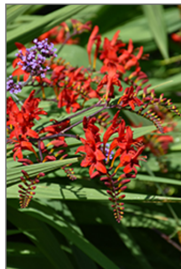
Lucifer Crocosmia flowers

Lucifer Crocosmia is recommended for the following landscape applications;