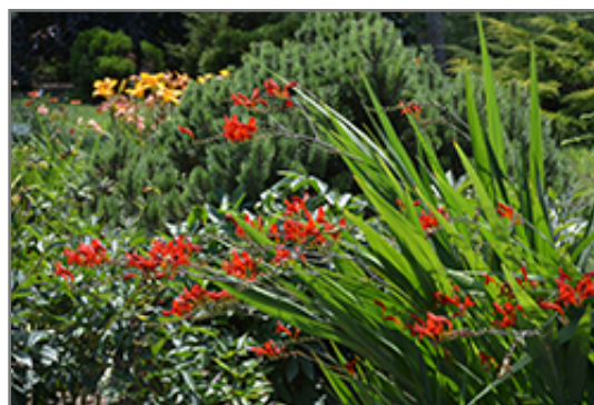
Lucifer Crocosmia in bloom