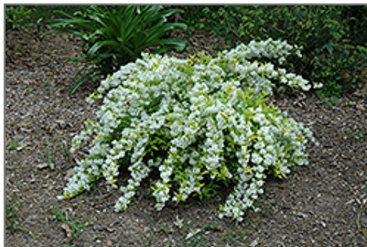
Chardonnay Pearls Deutzia in bloom

Chardonnay Pearls Deutzia is recommended for the following landscape applications;