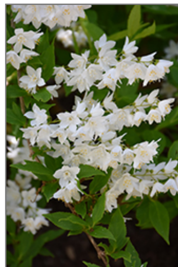
Chardonnay Pearls Deutzia flowers