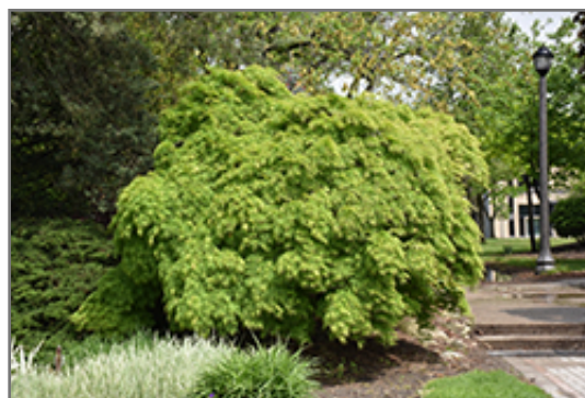
Cutleaf Japanese Maple