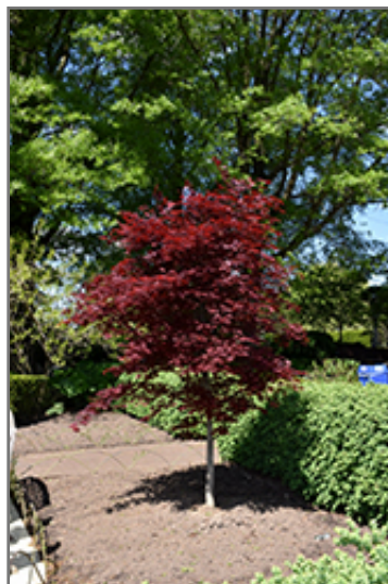
Fireglow Japanese Maple