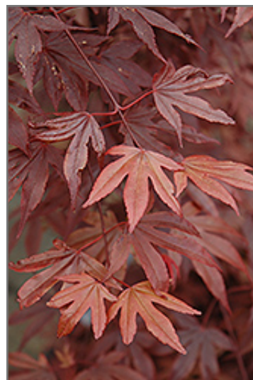
Fireglow Japanese Maple foliage