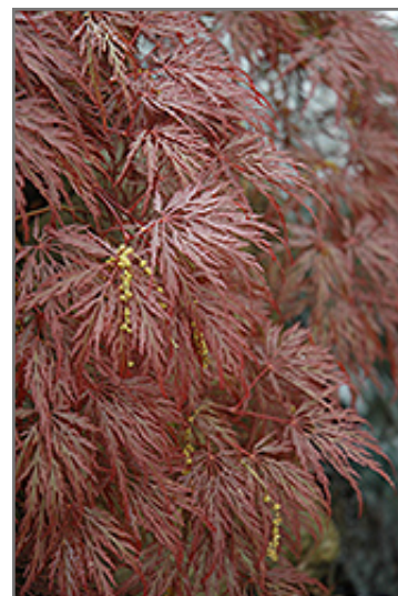
Inaba Shidare Cutleaf Japanese Maple foliage

Inaba Shidare Cutleaf Japanese Maple is recommended for the following landscape applications;