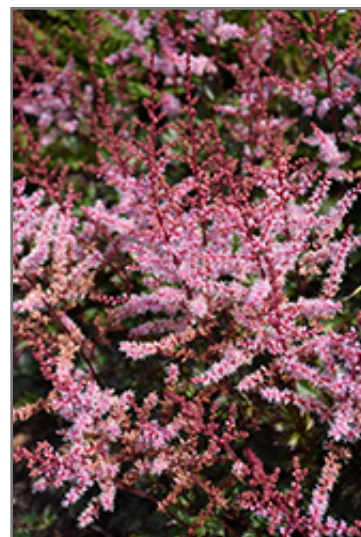
Delft Lace Astilbe flowers Photo courtesy of NetPS Plant Finder

This is a relatively low maintenance plant, and is best cleaned up in early spring before it resumes active growth for the season. It is a good choice for attracting butterflies to your yard, but is not particularly attractive to deer who tend to leave it alone in favor of tastier treats. It has no significant negative characteristics.