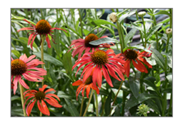
Tomato Soup Coneflower flowers