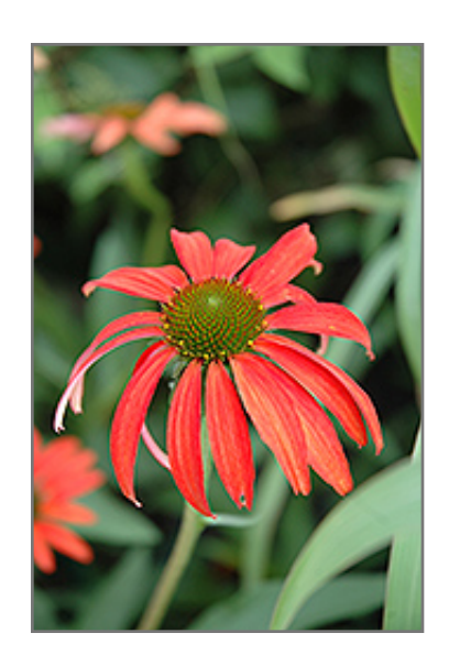
Tomato Soup Coneflower flowers