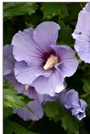
Blue Satin Rose of Sharon flowers