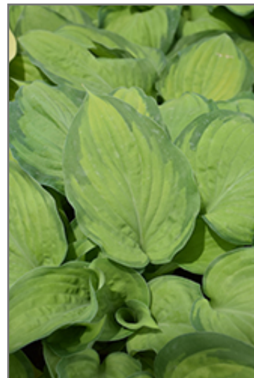
Paradigm Hosta foliage

This plant does best in partial shade to shade. It prefers to grow in average to moist conditions, and shouldn't be allowed to dry out. It is not particular as to soil type or pH. It is somewhat tolerant of urban pollution. This particular variety is an interspecific hybrid. It can be propagated by division; however, as a cultivated variety, be aware that it may be subject to certain restrictions or prohibitions on propagation.