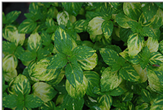
Variegated Ginger Mint foliage

Aside from its primary use as an edible, Variegated Ginger Mint is suitable for the following landscape applications;