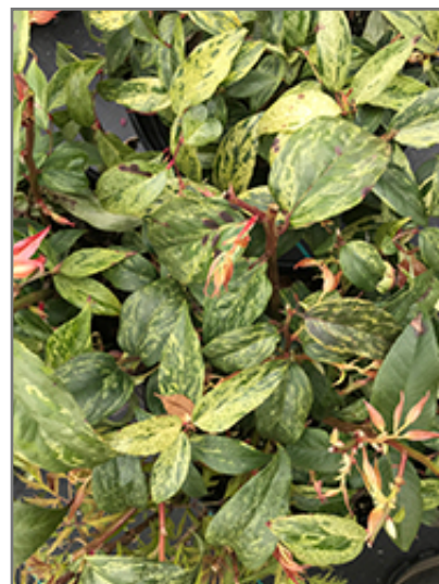
Rainbow Fetterbush foliage